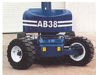
Class leading turning radius.