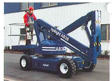
Compact stowed dimensions.