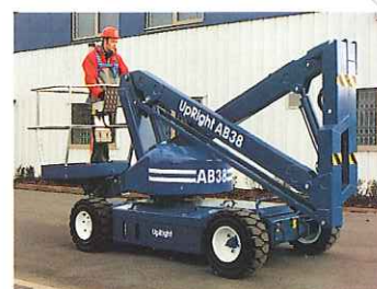
Compact stowed dimensions.

CE This product is available with the CE mark confirming compliance with all relevant European Machinery Directives