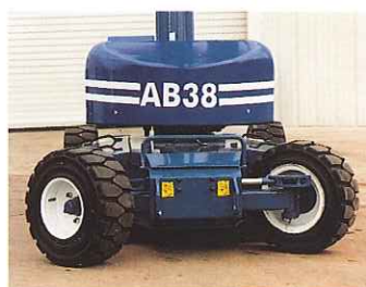
Class leading turning radius.