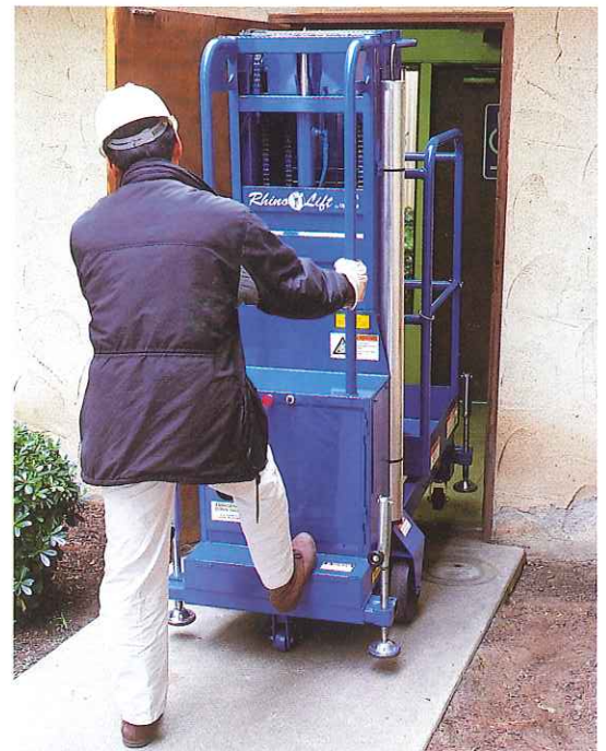
Transport wheels enable Rhino Lift to easily clear door threshold.