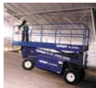
All models have oscillating axles to keep drive wheels in contact with uneven ground and have high levels of gradeability for tough sites and loading ramps.