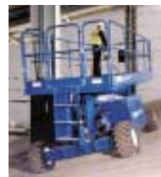
The Speed Level allows fast platform levelling on slopes and uneven ground.