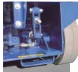
Non-marking tyres are fitted as standard to protect floor finishes.