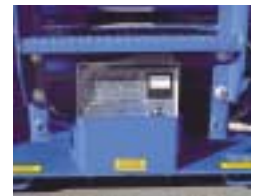
Easily-accessible rear-mounted battery charger allows operation during charging. Swing out modules allow access to all service components in seconds, encouraging regular maintenance.