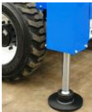
Hydraulic levelling outriggers with auto-level are provided as standard, making machine set up quick and easy.

Specifications subject to change without notice. Photos and diagrams in this brochure are for promotional purposes only. Refer to appropriate UpRight Operators manual for detailed instructions on the proper use and maintenance.