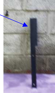
500882-002 MB20 MODEL

Extended section To protect Harness cable